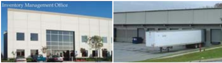
5 National and 34 Local Warehouses