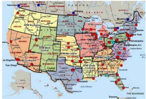
Locations of RPM FSOs